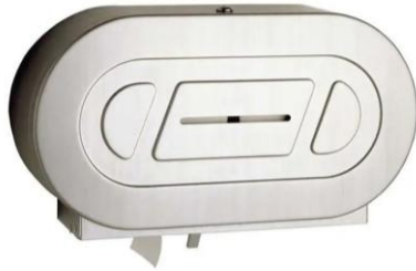
TOILET ROLL DISPENSERS