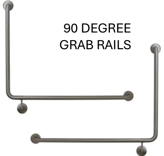
90 DEGREE GRAB RAILS