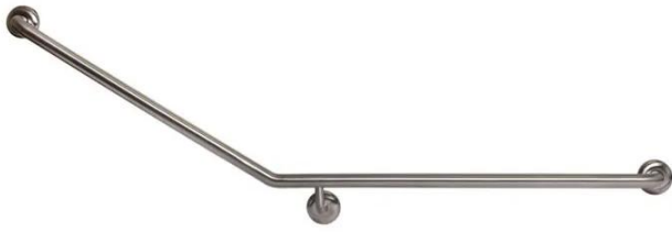
30 & 40 DEGREE GRAB RAILS